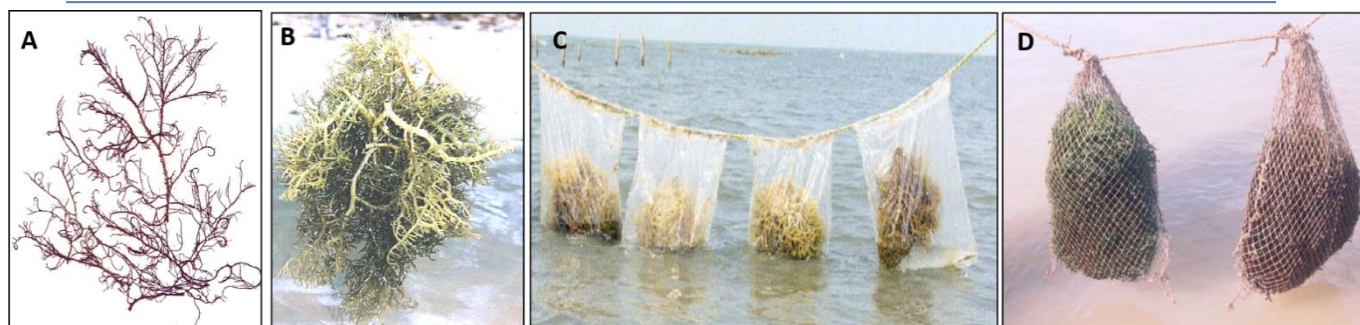
Picture 1: Macro algae A. Hypnea musciformis B. Kappaphycus alvarezii , Macroalgae cultivation methods C. In plastic bags, D. in nylon bags (Reddy et.al., 2003; 2005)