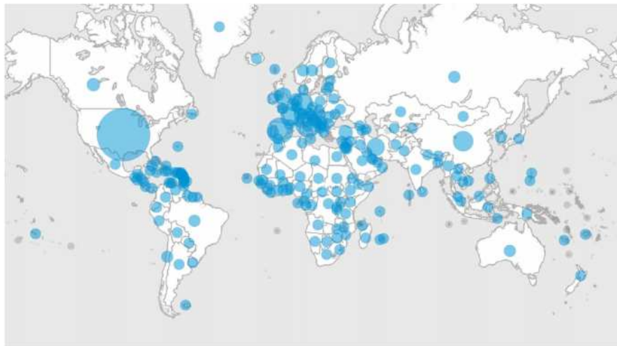
Figure 2: Current distribution of COVID-19 in different countries (WHO, 2020)

Moreover, 215 countries/regions have reported confirmed COVID-19 cases, including China, Italy, Iran, S. Korea, India, Switzerland, Taiwan, USA, Sweden, Singapore, Sri Lanka, France, Australia, Malaysia, Spain, United Arab Emirates, UK, Nepal, Finland, Netherlands, Japan, Belgium, Russia, Thailand, Philippines, Cambodia, Germany and so on (Figure 2).